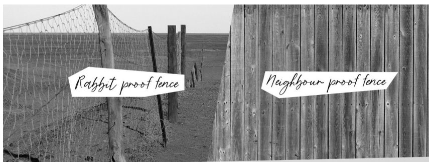
Rabbit proof fence