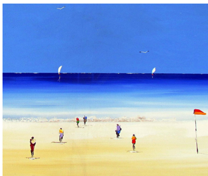
Proper social distance on Paradise Shore