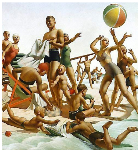
Alter-ego lifestyle dreamtime!