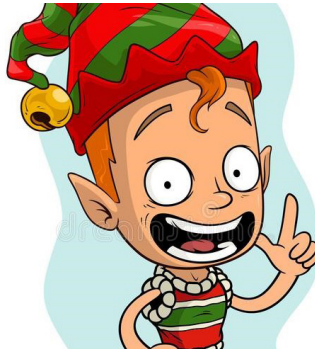
Ozzie Mental Elf! Oi Oi Oi

Cookie and happify us all to death. This is PANDORA and her JARR of DODGY OZ SECRETS... choofin' orf mate.